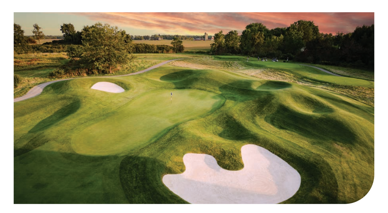
*All pricing is plus HST

• Includes round of golf with a shared cart and tournament services.